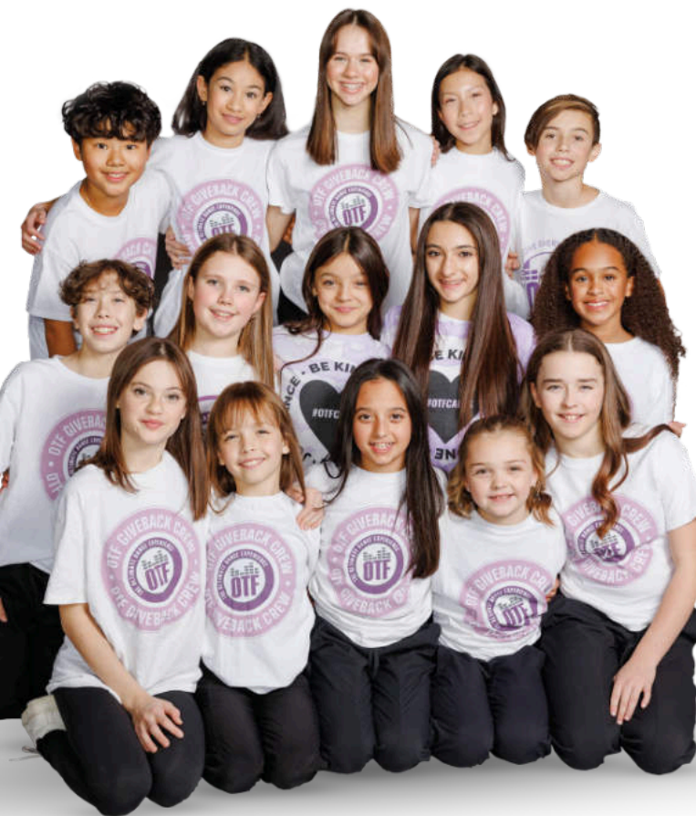
OTF Brand Ambassadors

To date, On The Floor has grossed over $600,000 for this cause!